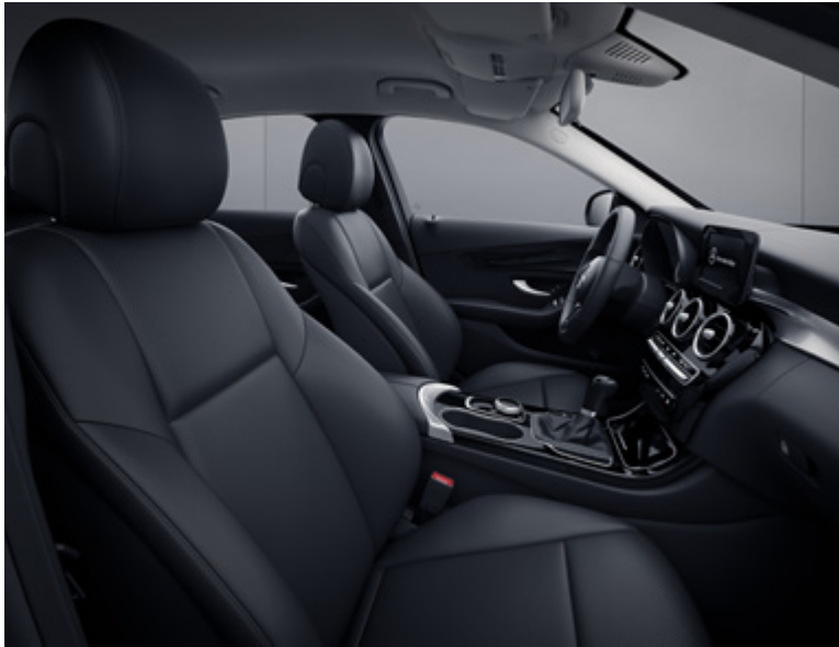
ARTICO man-made leather black (131A)