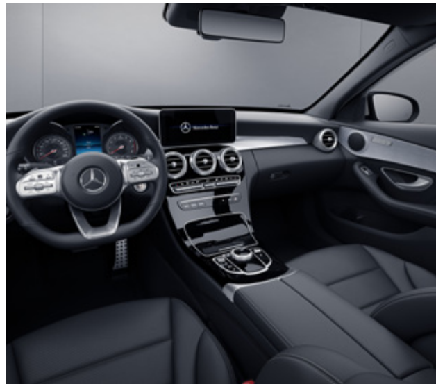
Black piano-lacquer-look / light longitudinal-grain aluminium trim (739) | Multifunction steering wheel - embossed leather (L5C) | DIRECT SELECT shift paddles (431)