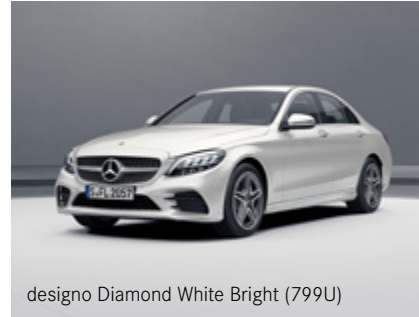
designo Diamond White Bright (799U)