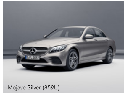
Mojave Silver (859U)