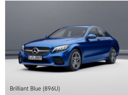
Brilliant Blue (896U)