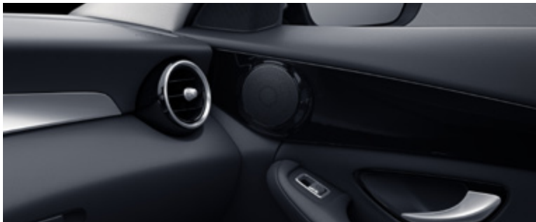
black piano-lacquer-look trim (H80)