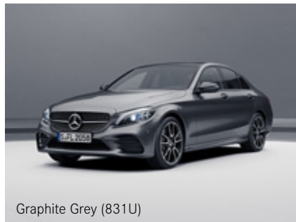
Graphite Grey (831U)