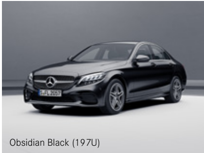
Obsidian Black (197U)