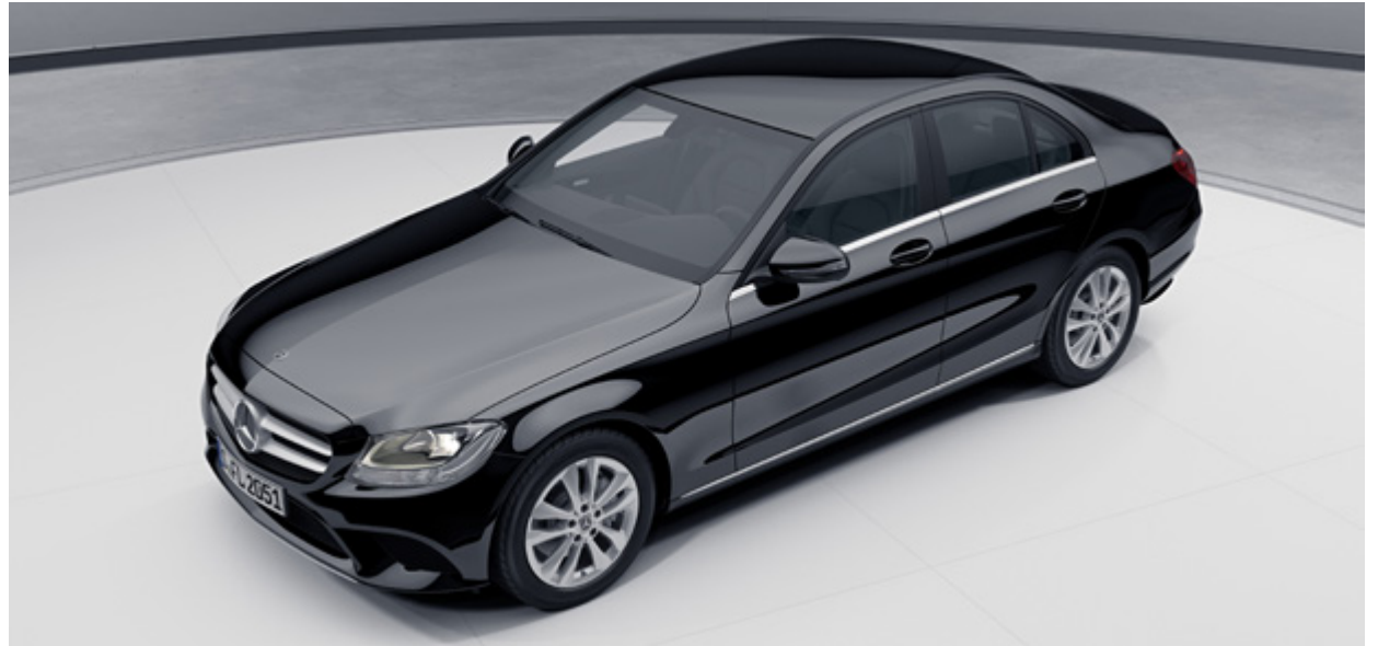
AGILITY CONTROL (485)