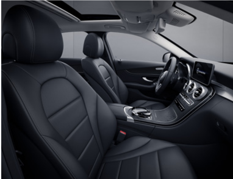
ARTICO man-made leather black (101A)