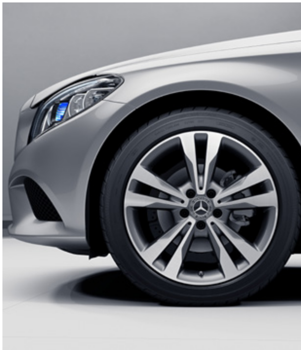
45.7 cm (18") 5-twin-spoke light-alloy wheels (22R)