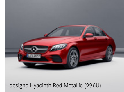
designo Hyacinth Red Metallic (996U)