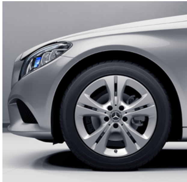
43.2 cm (17") 5-twin-spoke light-alloy wheels (R11)