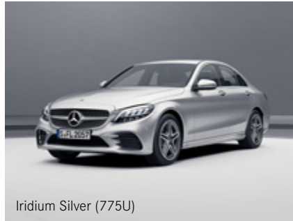
Iridium Silver (775U)