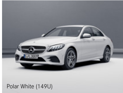
Polar White (149U)