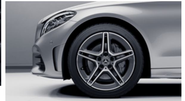
AMG 5-spoke light-alloy wheels (RSJ)