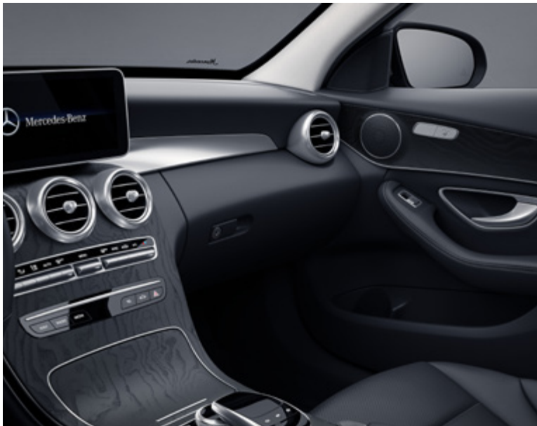
Open-pore black ash wood trim (736)