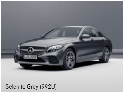
Selenite Grey (992U)