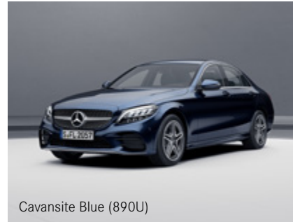
Cavansite Blue (890U)