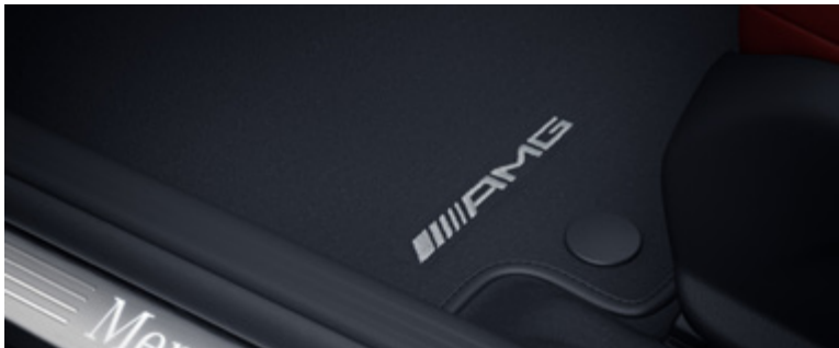
AMG floor mats (U26) | Interior lighting package (876)