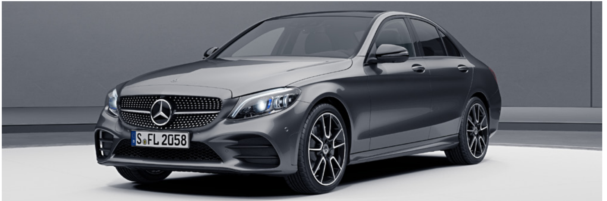
selenite grey (992U) | 48.3 cm (19") AMG 5-twin-spoke light-alloy wheels (604) | AMG Line exterior (P31) | Night package (P55)