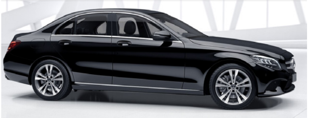
AGILITY CONTROL (485)