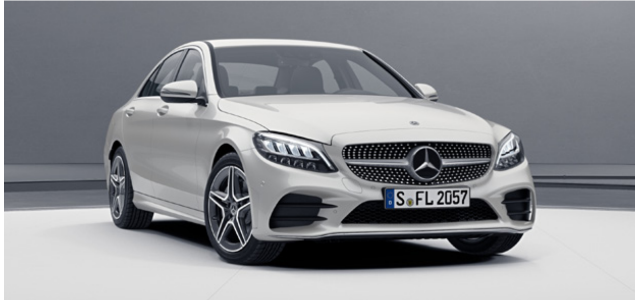
AGILITY CONTROL (485) | DYNAMIC SELECT (B59) | Diamond grille (5U4) | AMG bodystyling (772)