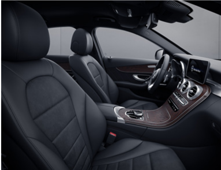
ARTICO man-made leather / DINAMICA microfibre black (661A)