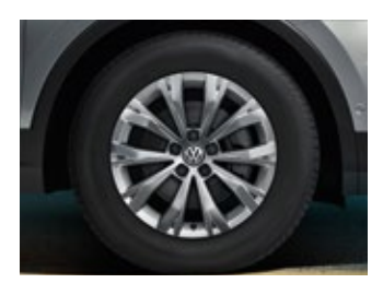
Montana 17" alloy wheels (Standard on Trendline)