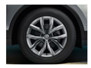
Kingston 18" alloy wheels (Standard on Highline and Optional on Comfortline)