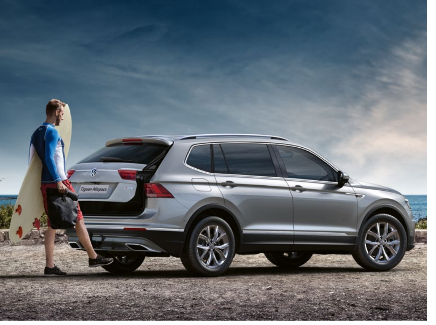
Easy open/easy close. Exclusive to the Tiguan Allspace Highline