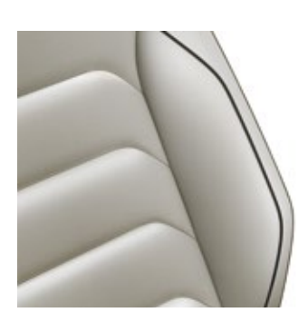
Vienna Storm Grey