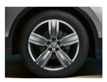
Victoria Falls 19" alloy wheels (Optional on all trim lines)