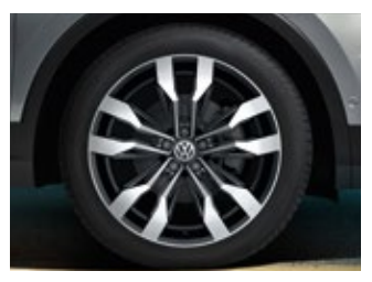
Suzuka 20" alloy wheels (Optional on Highline only with R-Line)