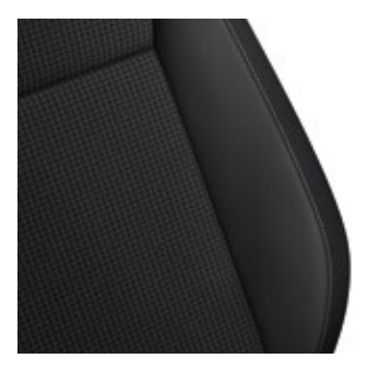
Microdot Titanium Black (Tiguan only)