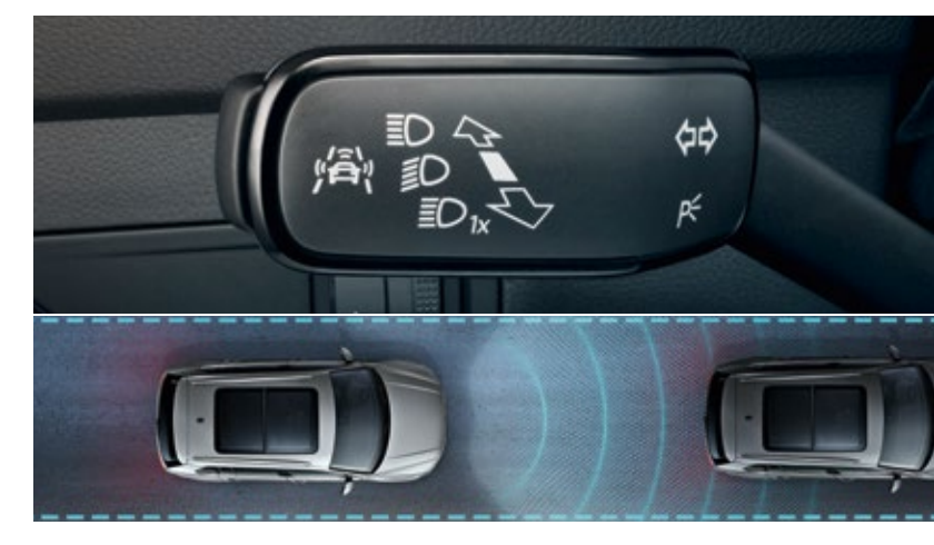
Adaptive Cruise Control with Front Assist (forward collision warning)

When ACC is activated, the vehicle automatically brakes and accelerates in a speed range set by the driver. If another vehicle approaches, the ACC brakes the car to the same speed and maintains the pre-selected distance.