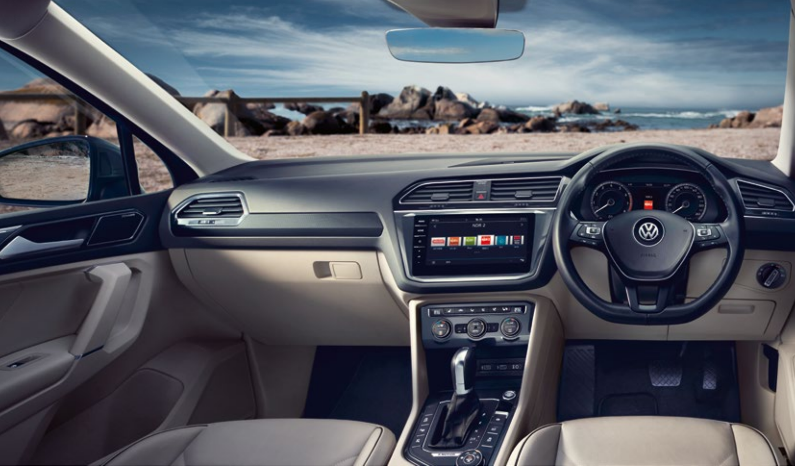
Highline interior (Optional Discover Pro show)