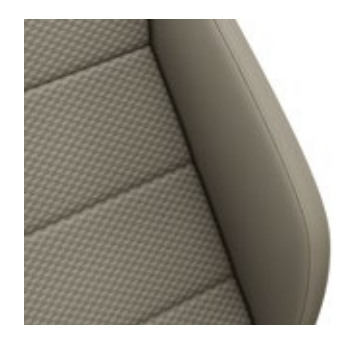
Lasano Storm Grey (Tiguan Allspace only)