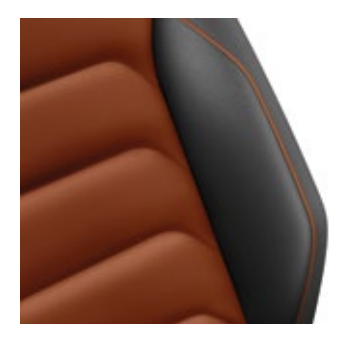
Vienna Safrano Orange / Titanium Black