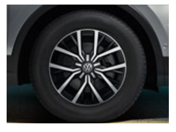
Tulsa 17" alloy wheels (Standard on Comfortline)