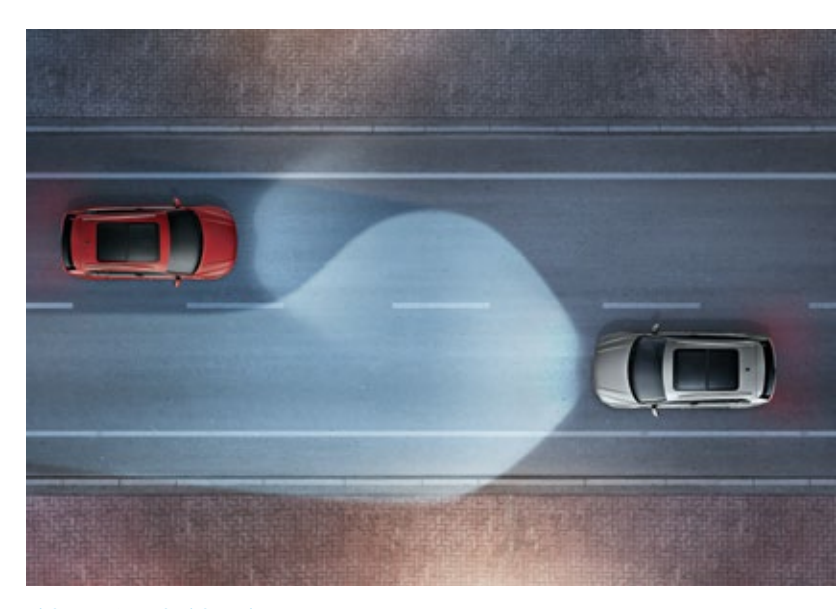
High Beam Control "Light Assist"