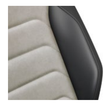
Art Velours Storm Grey