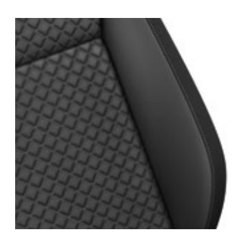
Rhombus Titanium Black / Storm Grey