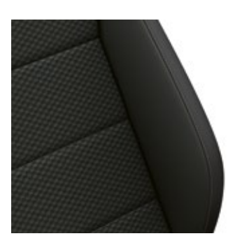
Lasano Titanium Black (Tiguan Allspace only)