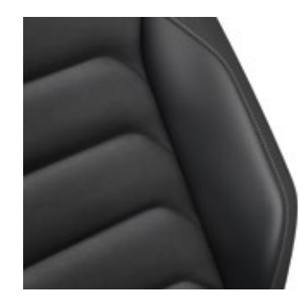
Art Velours Titanium Black