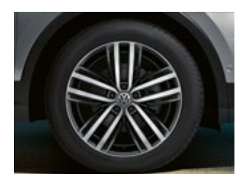
Auckland 19" alloy wheels (Optional on Trendline (Tiguan only), Comfortline and Highline)