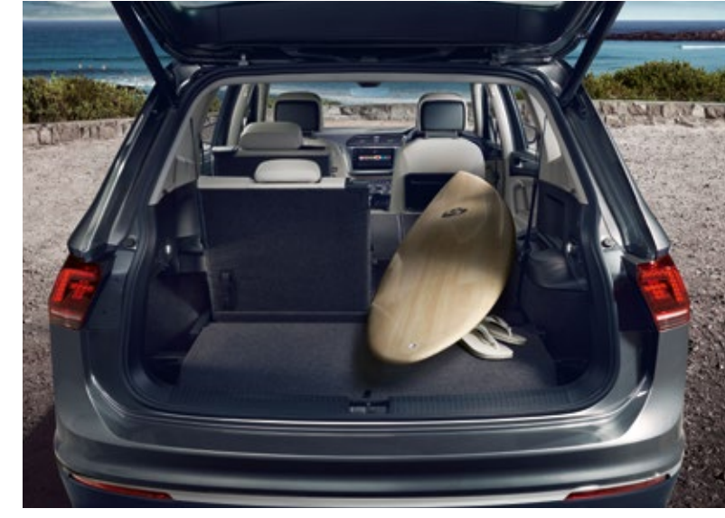
Luggage compartment behind third seat row with load through facility

This gives passengers more leg room than ever before. The boot is also bigger and the third row of seats allows up to seven people to travel comfortably. With the Tiguan Allspace, you can fit more into life.