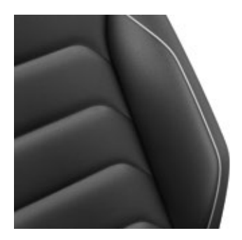
Vienna Titanium Black